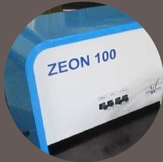
ZEON 100 Small-Scale